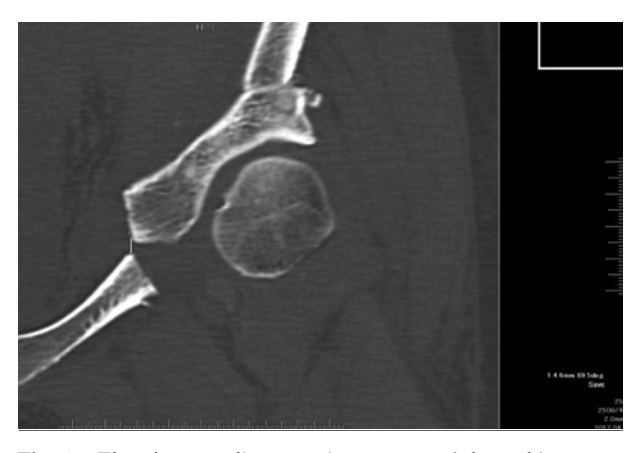
Fig. 1 The shortest distances in vacancy of the pubic ramus osteotomy site were measured on computed tomography (CT) images.

We measured the narrowest part of the CT slice during assessment of the vacancy of the osteotomy site of the pelvic ramus. CT imaging was performed 1 week postoperatively. CT slices were taken at 5-mm intervals in the coronal view (Fig. 1).