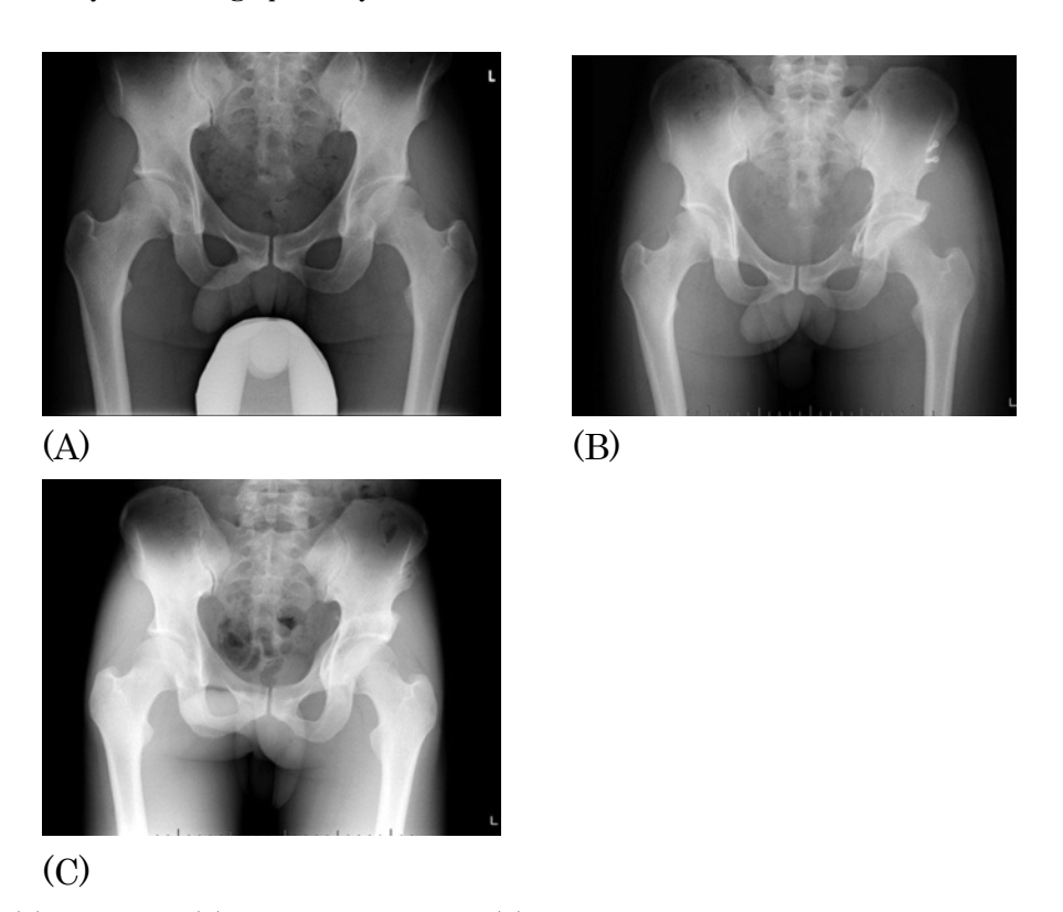
Fig. 2 (A) Preoperative, (B) a week postoperative and (C) 2-year postoperative AP radiographs showing the hips of 44-year old patient with hip dysplasia. There was union of the superior pubic ramus.

A 48-year-old woman had left hip pain since the age of 40 years. The AP radiograph showed acetabular dysplasia of the both hips (Fig. 3A). CPO was performed on the left hip, after which joint congruency was improved. Although the radiograph at 2 years after CPO showed non-union of the superior pubic ramus (Fig. 3B). Harris hip score improved 75 points preoperatively to 96 points postoperatively.