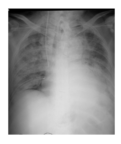
After second lobectomy (day 22)