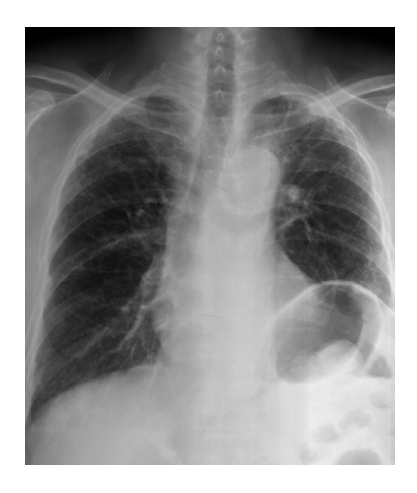
Before second lobectomy